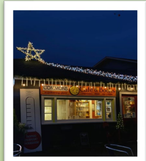
SW Commons On 2 nd Street