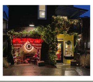
The Boatyard Inn On Wharf Street