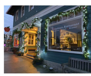
The Braeburn On 2 nd Street