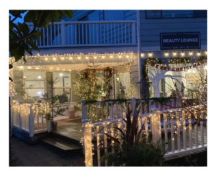
The Beauty Lounge Tucked in on 2 nd Street

All committee meetings are held at the LMSA office at 195 2 nd St