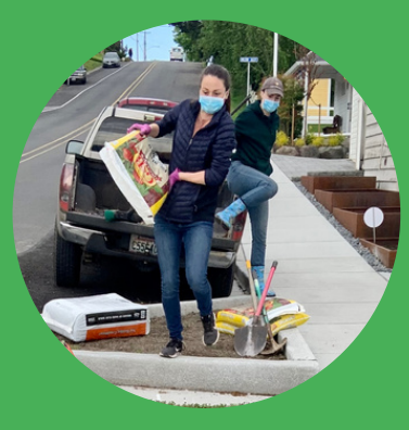
LMSA revamped the bumpouts a the corner of Anthes and 2nd St across from Langley Park.