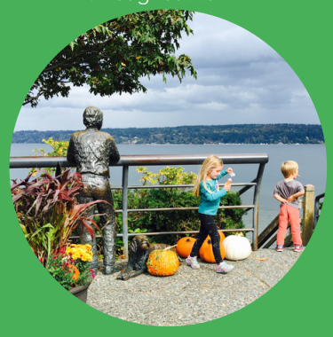
Fall is the time of year for pumpkins and autumn leaves, and of course, our signature crows!