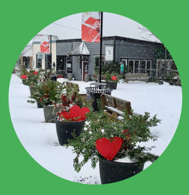
We tried to keep spirits up with themed decorations this year.

The Promotion Committee's purpose is to create excitement and vibrancy in Langley's downtown district. Our goals include fostering community involvement, cultivating playful lively activities, and nurturing Langley's unique identity.