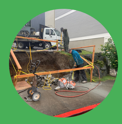
Concrete forms were created and poured for stairs project.