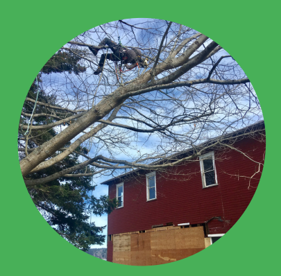
LMSA contracts with Arbor Dreams to maintain the health of the trees in the downtown district

The primary responsibilities of the Design Committee are to maintain and improve the appearance of the city, and to build public awareness of local history and renovation of historic buildings.