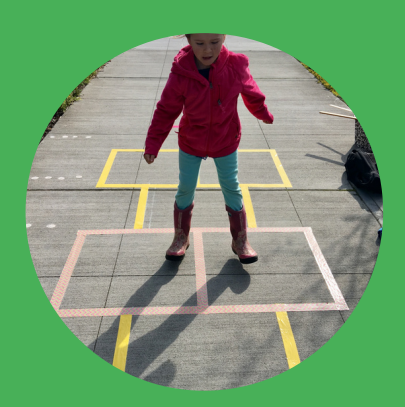
We made sure to install our famous hopscotch games throughout town.