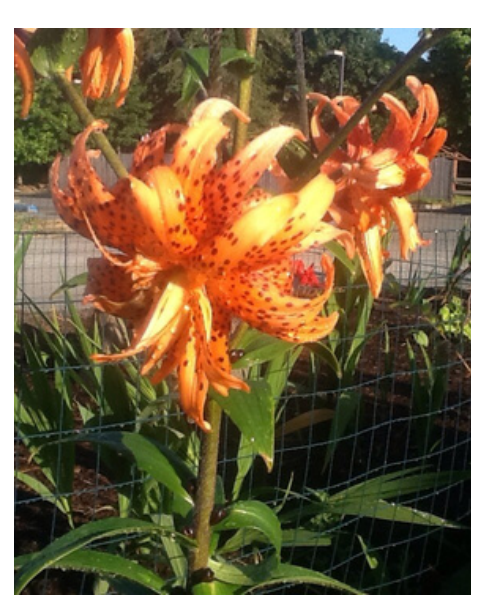
Energy from the Design Committee presents Langley as a garden town, a well-designed and maintained economic boost, an encouraging backdrop for living here and doing business here. Horticultural professionals guide volunteers every Tuesday morning. It's fun and you are always welcome!