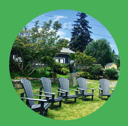
Funding supports improving and creating third spaces such as Langley Park.

The Organization Committee sustains the well-being of the Langley Main Street Association through funding, volunteers and members