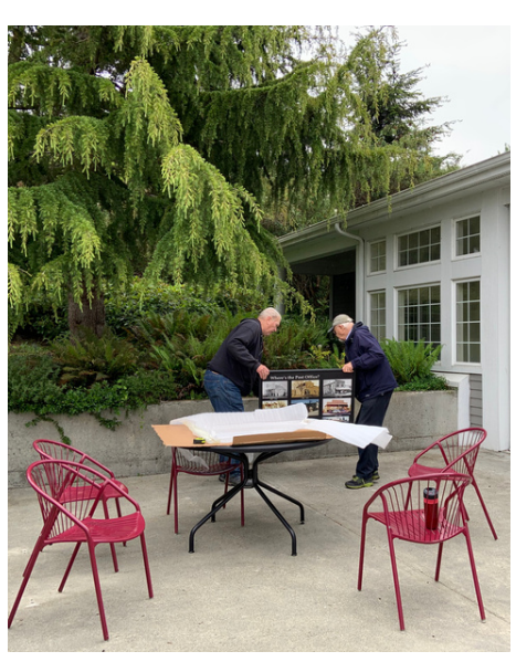
The appearance and functionality of the plaza at the north end of the Post Office was greatly improved. The plaza was pressure washed, deteriorating benches were removed and replaced with movable tables and chairs to encourage public use of the space. A panel of historic photos illustrating the history of the Post Office was also installed.