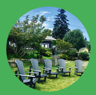
Funding supports improving and creating third spaces such as Langley Park.

The Organization/Outreach Committee sustains the wellbeing of Langley Main Street Association through cultivating funding, volunteers, and members.