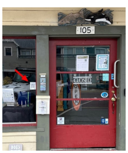
QR Code example from Langley Whale Center