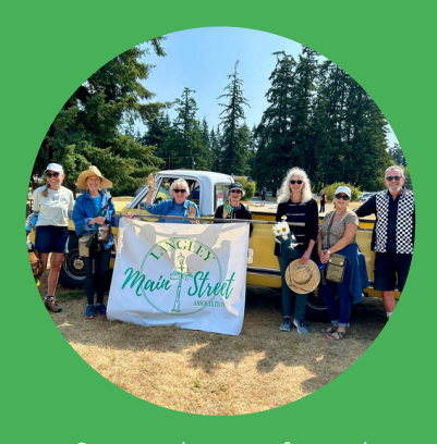
Our members are fun and supportive!