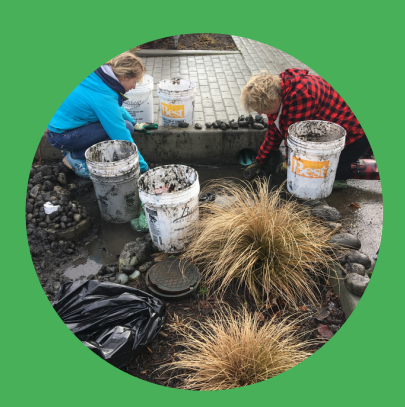
Our volunteers are amazingly dedicated!